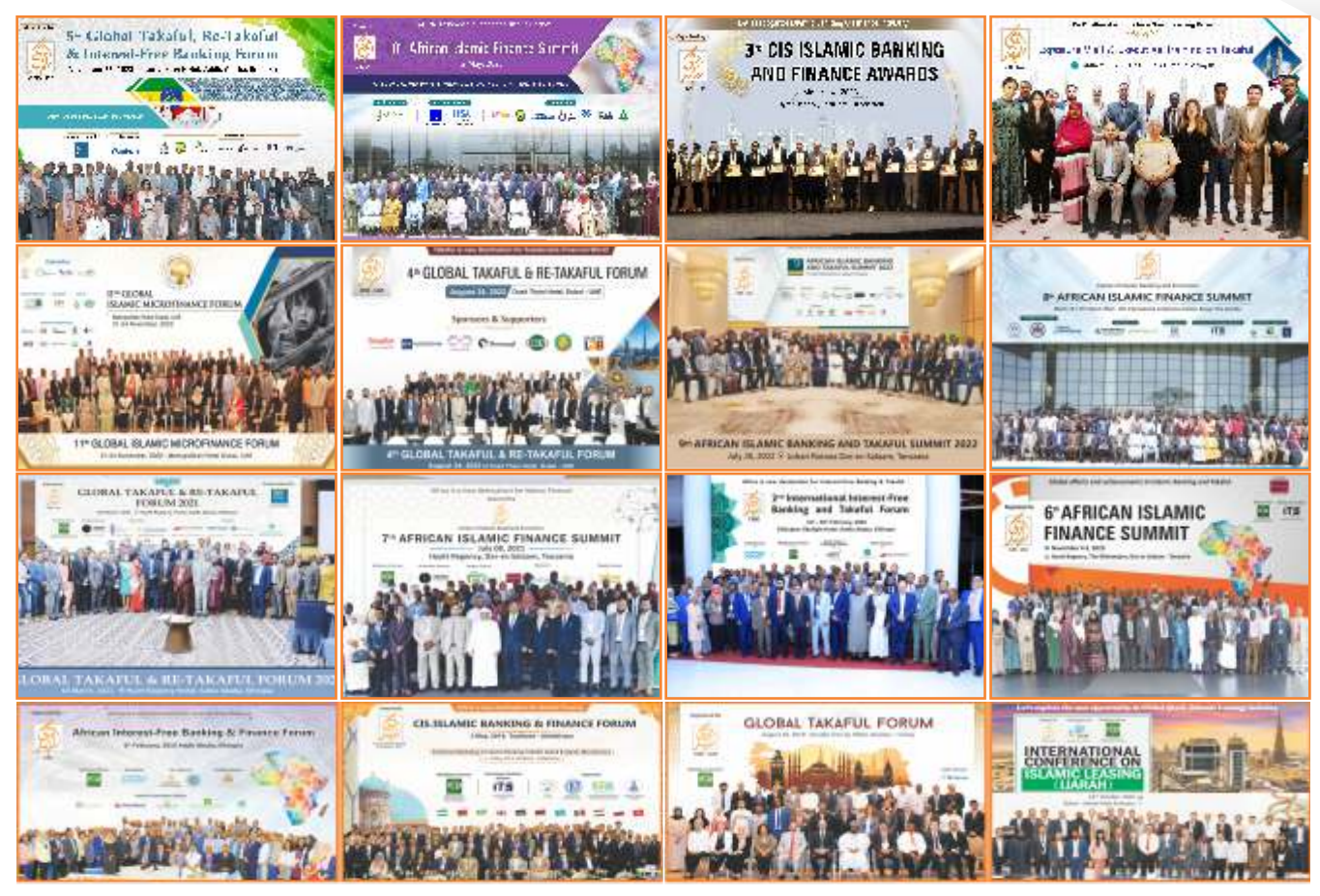
8th Global Islamic Microfinance Forum 2018